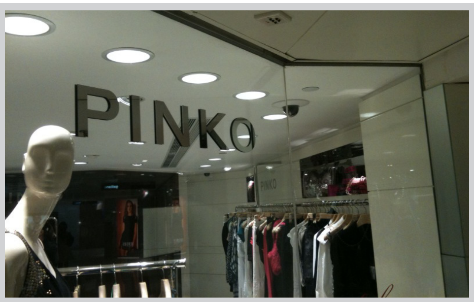
Lauren Bright, a leading Chinese wholesale and retail enterprise for European clothing, uses Arecont Vision megapixel cameras for anti-theft protection.

Arecont Vision 1.3 and 2 Megapixel Cameras Installed in New Shop For Italian Brand Pinko