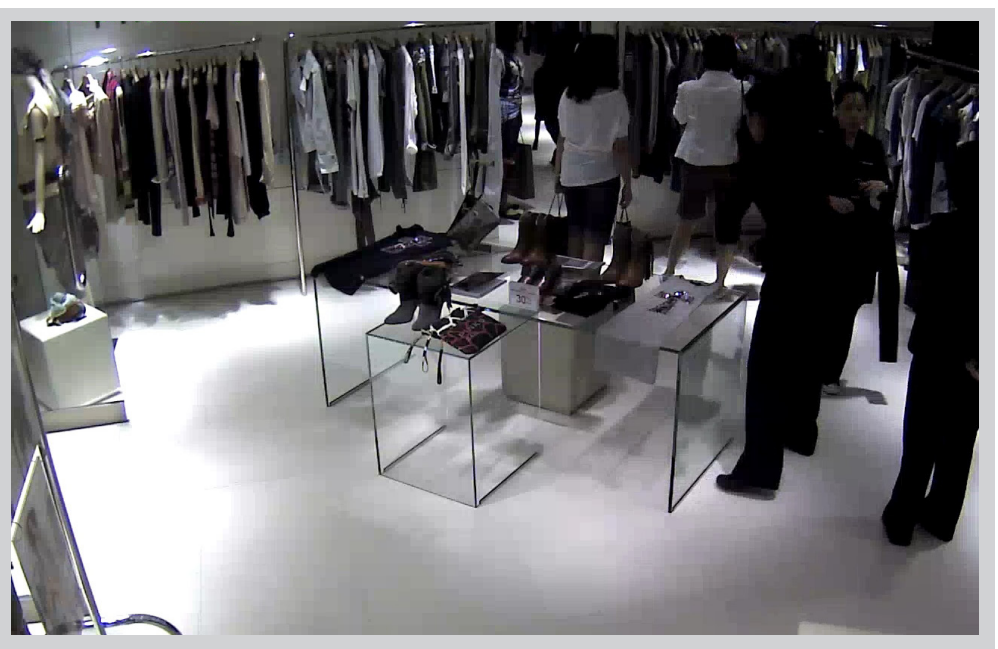
Cameras installed at Lauren Bright's Pinko store were four Arecont Vision 1.3 megapixel cameras and Arecont Vision's AV2155DN, a 2 megapixel day/night camera.

on megapixel video. Cameras installed at Lauren Bright's Pinko store were four Arecont Vision 1.3 megapixel cameras and Arecont Vision's AV2155DN, a 2 megapixel day/night camera.